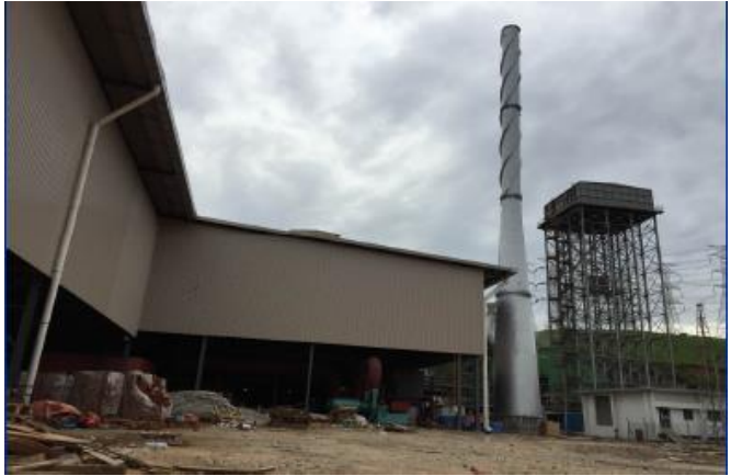
Overview of Stack & Furnace Area