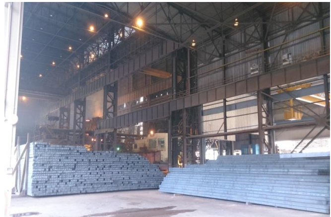
Billet Storage Area