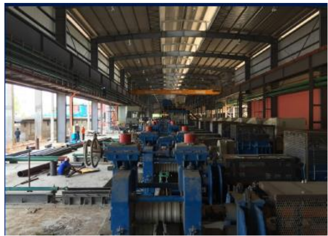
Rolling Mill Area