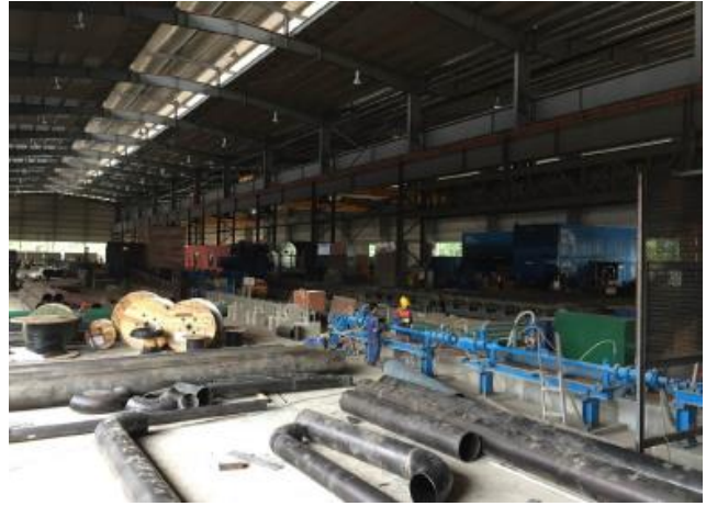
Temp Core System