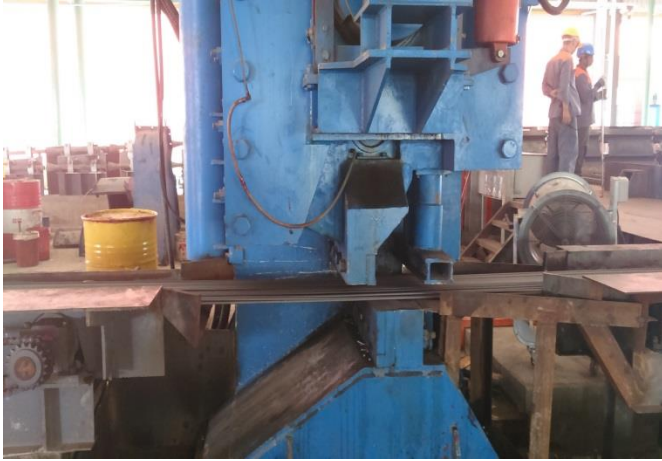
Steel Bar Cutter