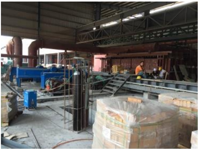
Billet Charging Area