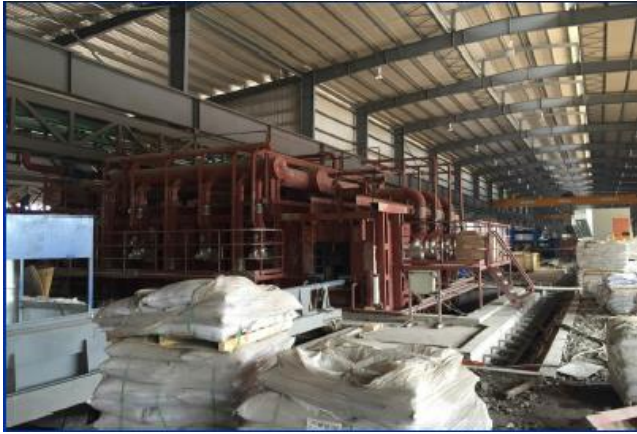
Reheating Furnace Area